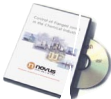
A DVD presentation explains the principles of best practice.